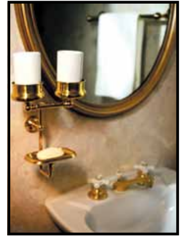
In the bathroom . . .