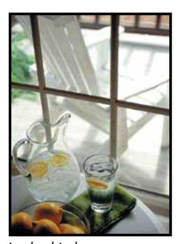
In the kitchen . . .