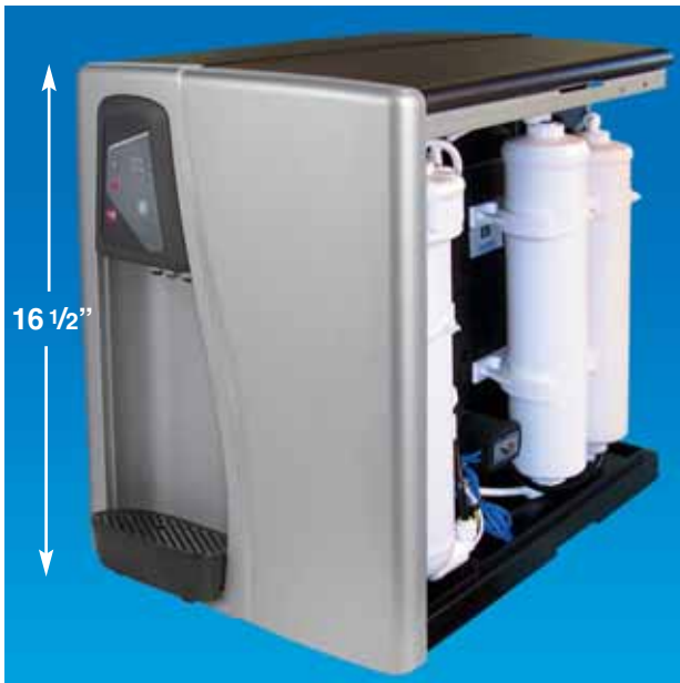
Side panel removes for easy access to filters