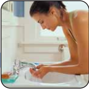
Better in the bath.