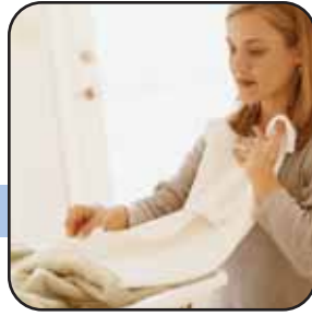
Better in the laundry.