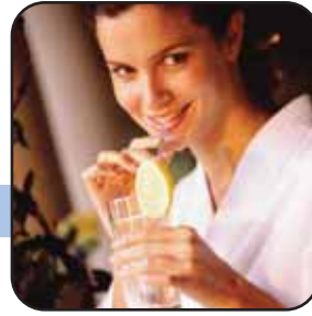
Better from the faucet.