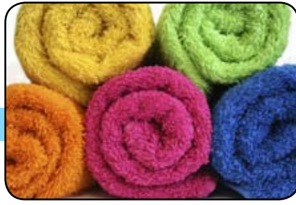
Better in the laundry.