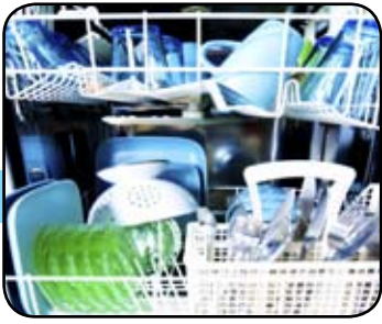
Better in the kitchen.