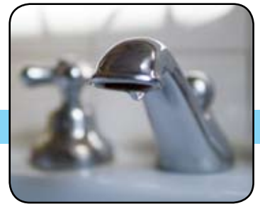
Better in the bathroom.